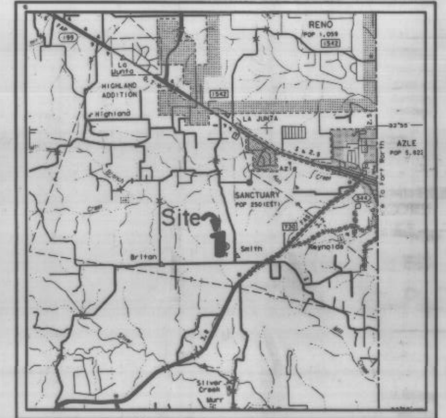
LOCATION MAP SCALE 1" = 2 MILES