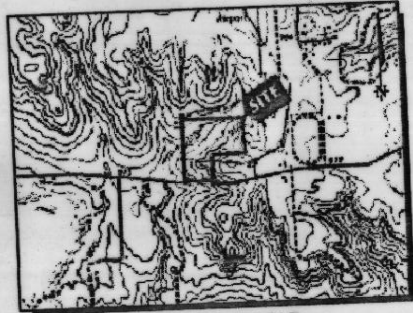
LOCATION MAP SCALE: 1"=2000'

PRIVATE DEVELOPMENT GATED COMMUNITY PRIVATE ROADS