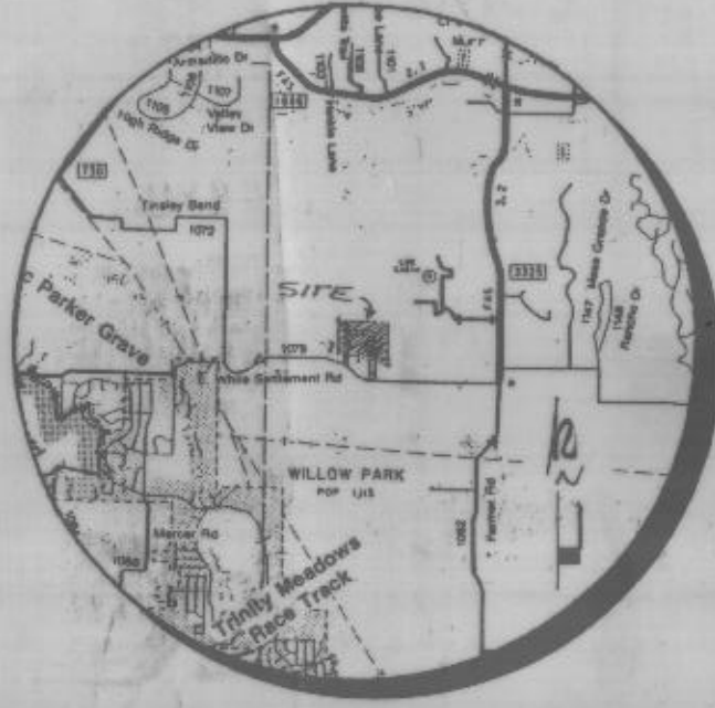
VICINITY MAP M.T.S.